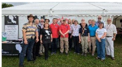
Royal Lancashire Show 2024 Church Tent Team