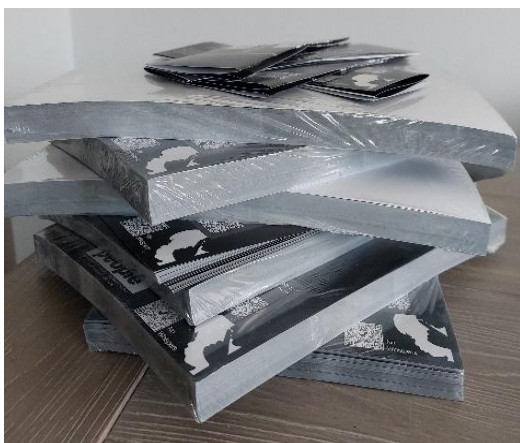
Copies of the zine ready to be 6 x folded

Pro vision World Ltd gave us the opportunity to show a 60-second awareness raising film at the Royal Preston Hospital in association with Lancashire Teaching Hospitals NHS Trust. The film was installed in Dec 2024 and is shown on 70" digital screens in the main A & E waiting room, Under 18's A & E waiting room and in Urgent care waiting room. The film will continue to be seen throughout 2025 with copies of the zine available in all waiting rooms.