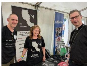
The Bishop of Blackburn The Rt Revd Philip North